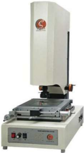
Vision Measuring System