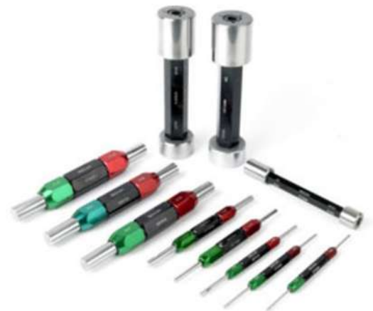
Plain Plug Gauges (Go - No Go)