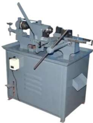
Semi Automatic Turning Machine