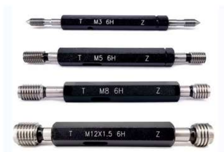
Thread Plug Gauges (Go - No Go)