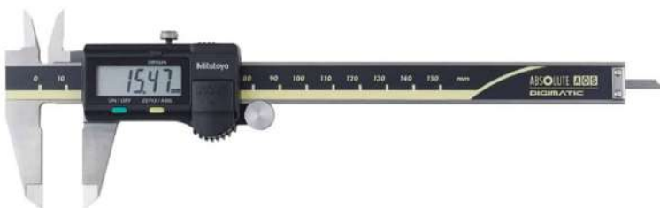
Digital Caliper Vernier