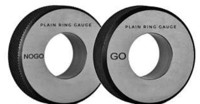
Plain Ring Gauges (Go - No Go)