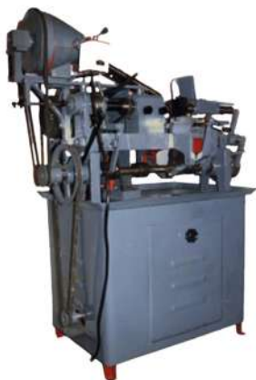
Special Purpose Machine