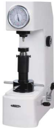
Manual Hardness Tester