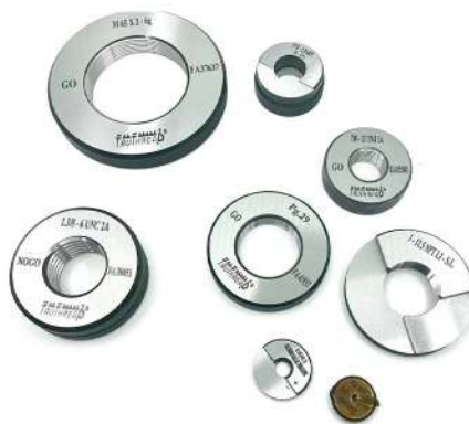
Thread Ring Gauges (Go - No Go)